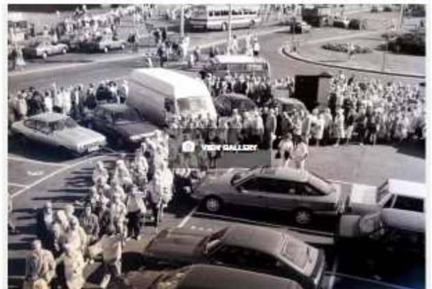
Cambridge OAPs arriving in Yarmouth in 1980